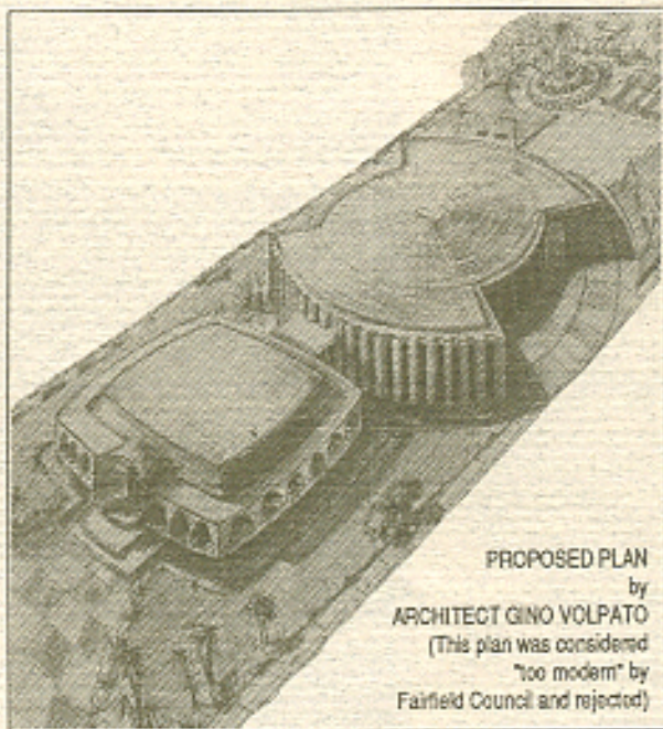
PROPOSED PLAN by ARCHITECT GINO VOLPATO (This plan was considered "too modern" by Fairfield Council and rejected)